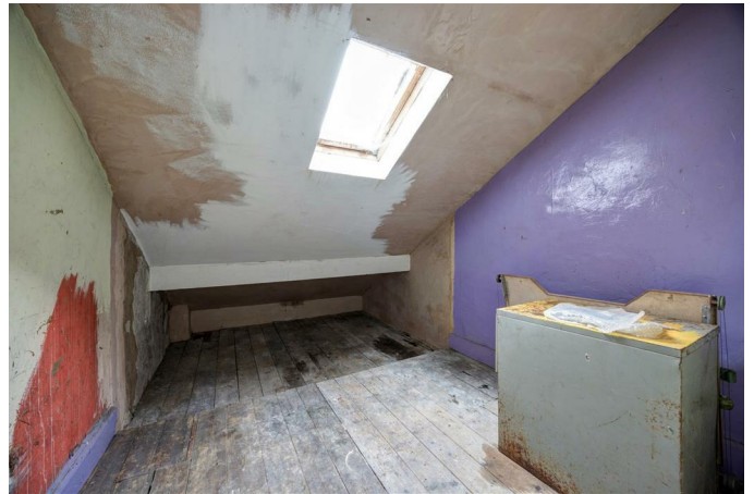
Small attic room with floor boards, Velux window.