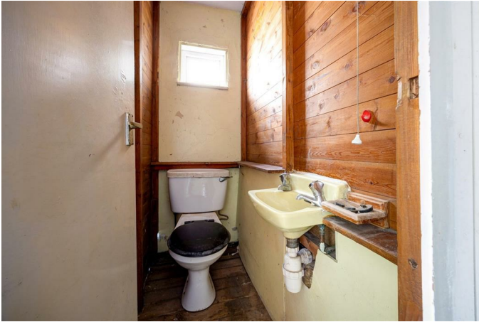
Floor boards, wash basin, toilet, double glazed window to side aspect.