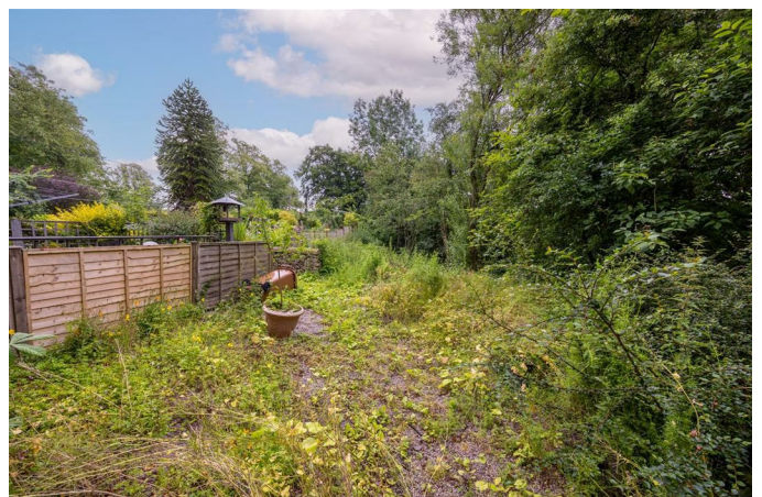
Good sized enclosed garden.