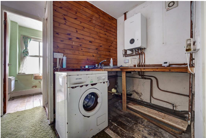
Floor boards, radiator, single drainer sink, boiler, worktop with single drainer sink, washing machine, extractor fan.