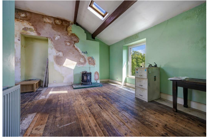
Substantial attic room, floor boards, 2 radiators, fireplace, base units, 1.5 drainer sink, exposed beams, double glazed windows to front and rear aspect, 3 Velux windows.