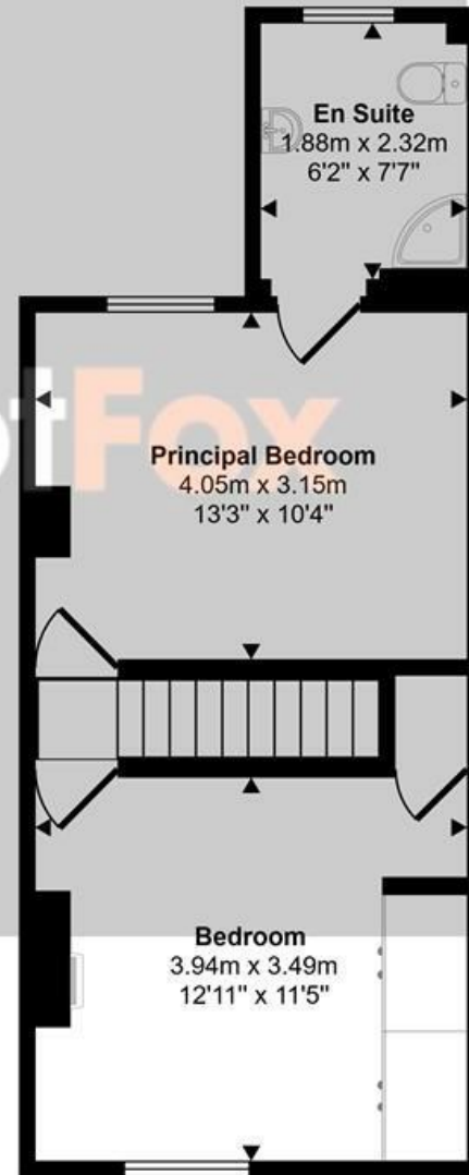
First Floor Approx 36 sq m / 382 sq ft