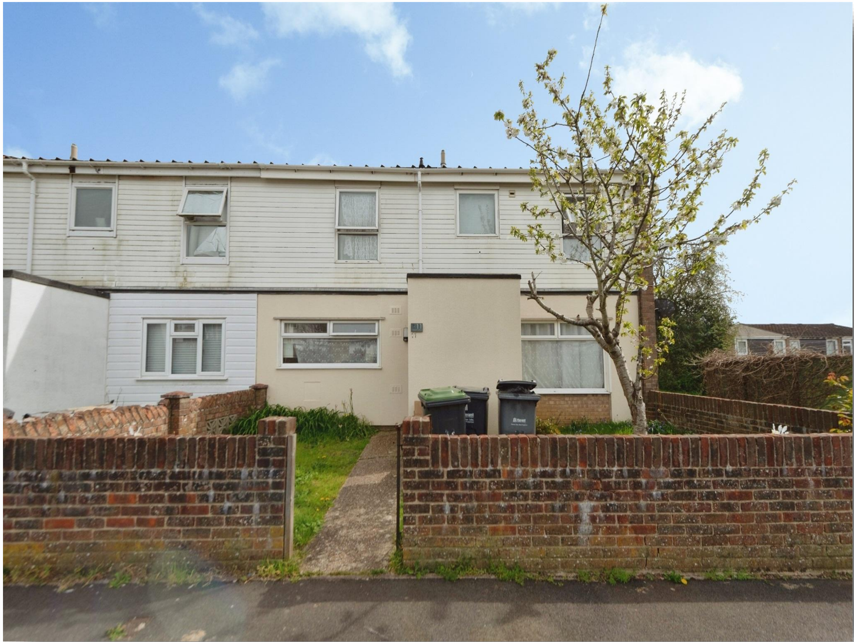
Curlew Gardens, Waterlooville PO8 9UD