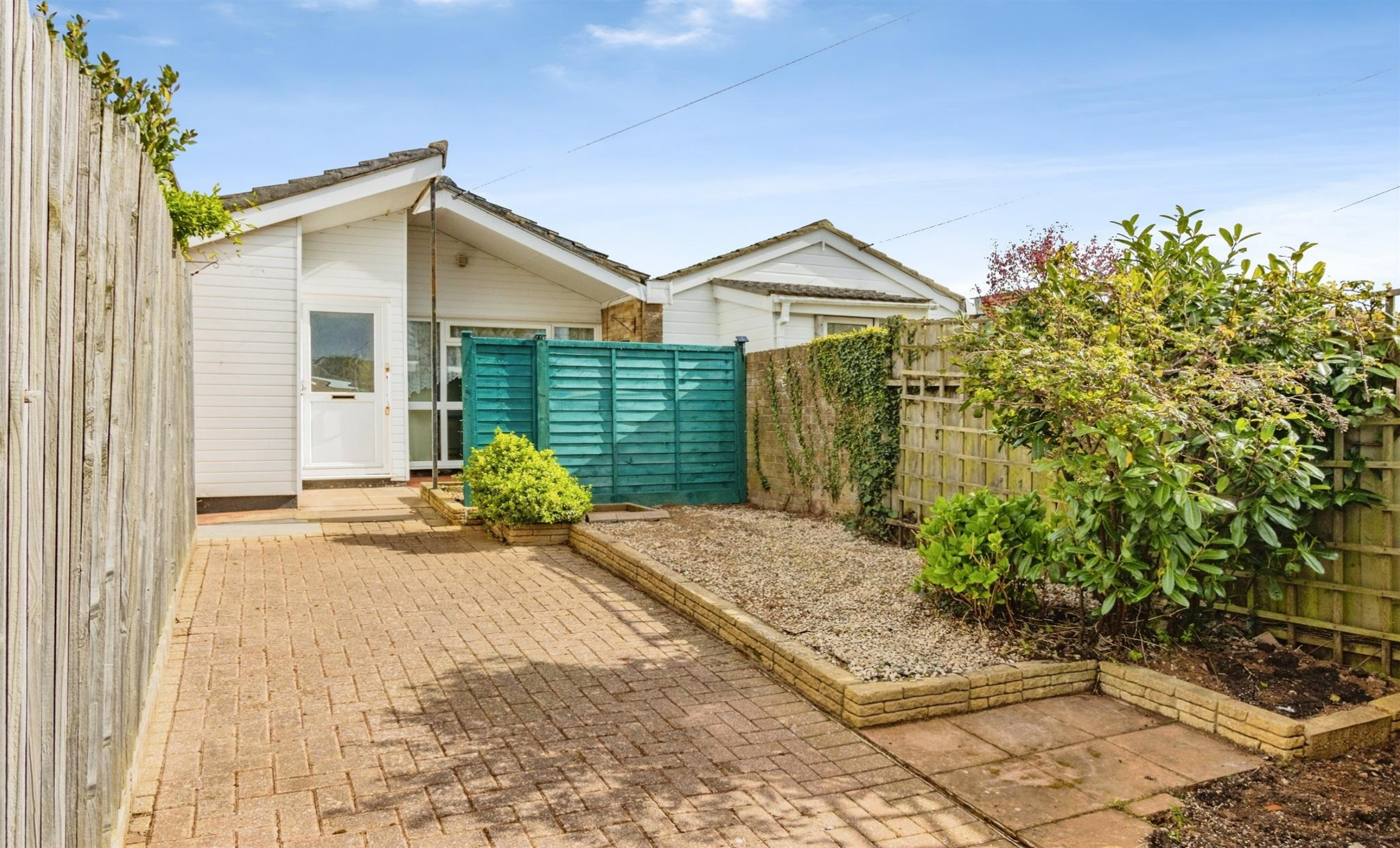
Cumberland Green BRIXHAM