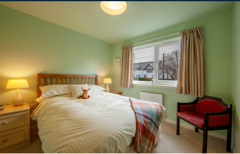
Bedroom 1: 4.76m x 2.97m, window to rear, built-in wardrobes with mirror sliding doors, central heating radiator, ceiling light fitting, fitted carpet.