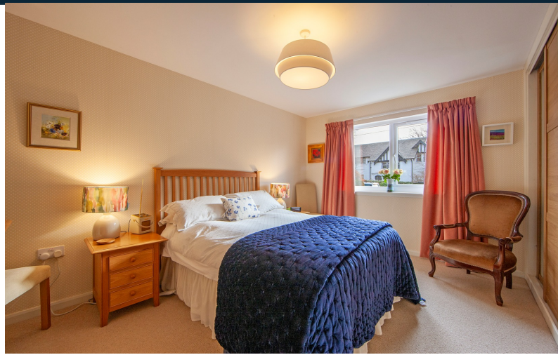
Bedroom 2: 4.16m x 3.43m, window to front, fitted wardrobes with mirror sliding doors, central heating radiator, ceiling light fitting, fitted carpet.