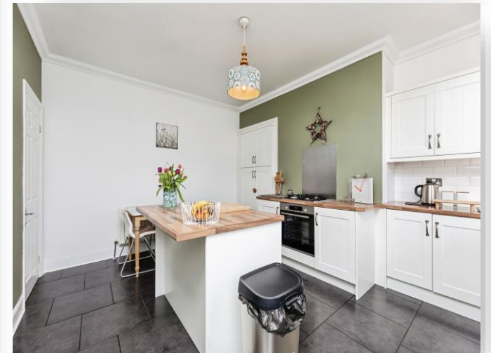
Queen Street, East Ardsley Wakefield WF3 2BE