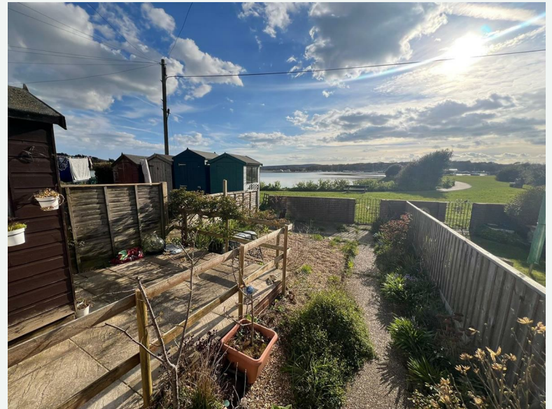
9 Mill Terrace, Yarmouth, Isle of Wight