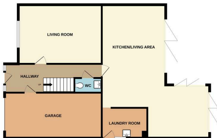
GROUND FLOOR 1073 sq.ft. (99.7 sq.m.) approx.