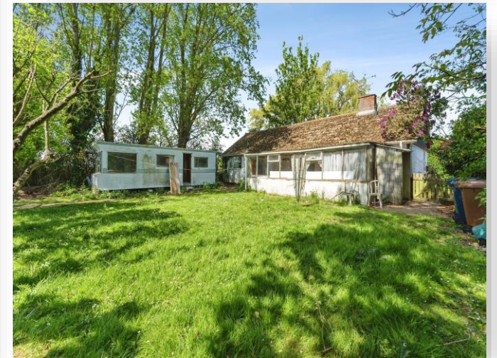
White Gates Farm, Upwell Road, March PE15 0DP