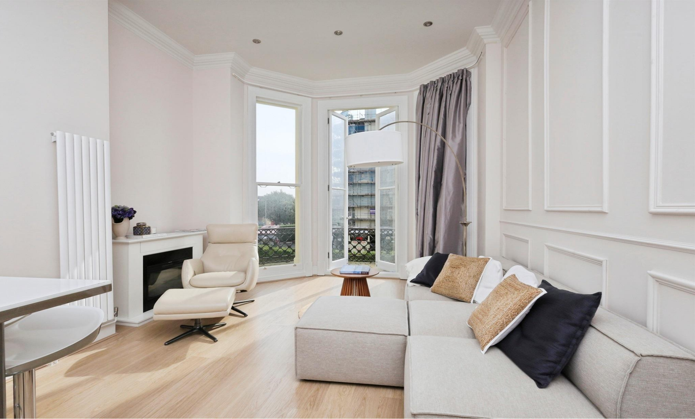
Queens Gardens, Eastbourne BN21 3EF