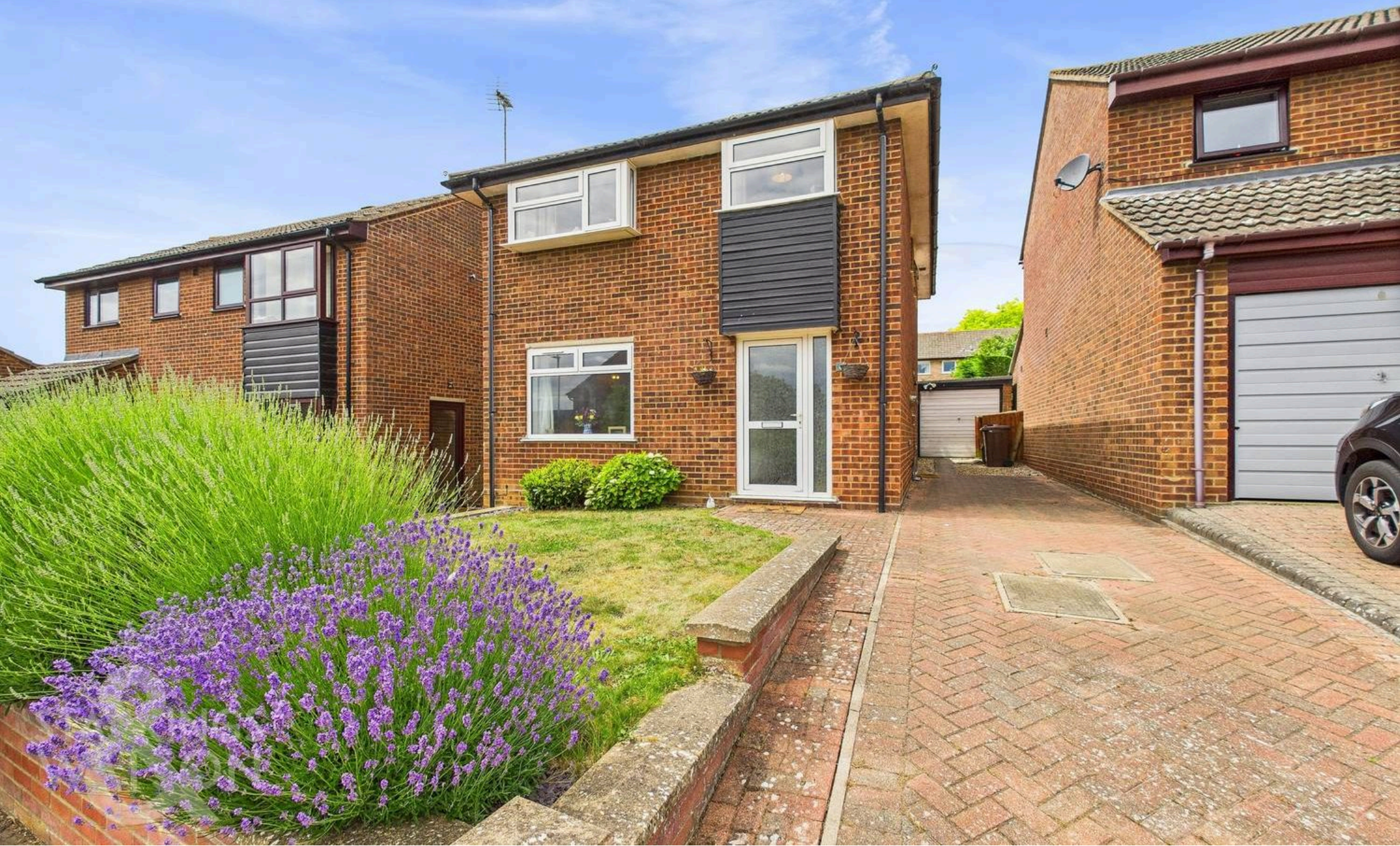
Medeswell Close, Brundall - NR13 5QG