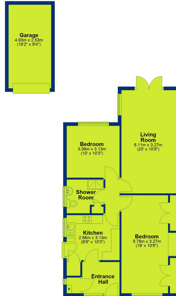
Total area: approx. 83.4 sq. metres (898.0 sq. feet)