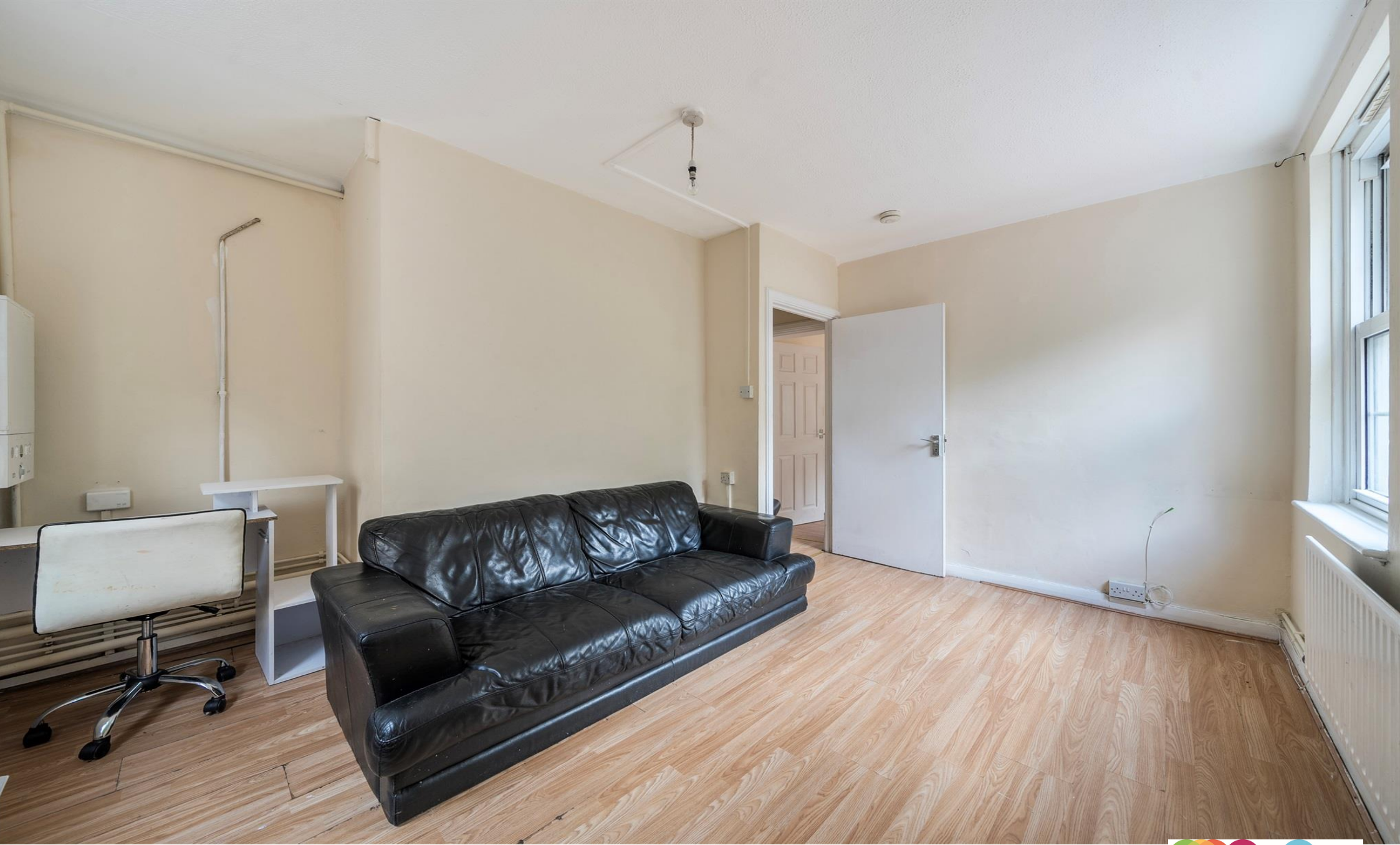
Burns House Doddington Grove, London SE17