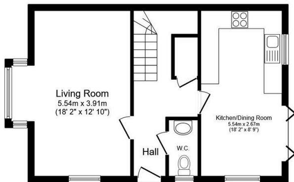
Ground Floor Floor area 47.3 sq.m. (510 sq.ft.)