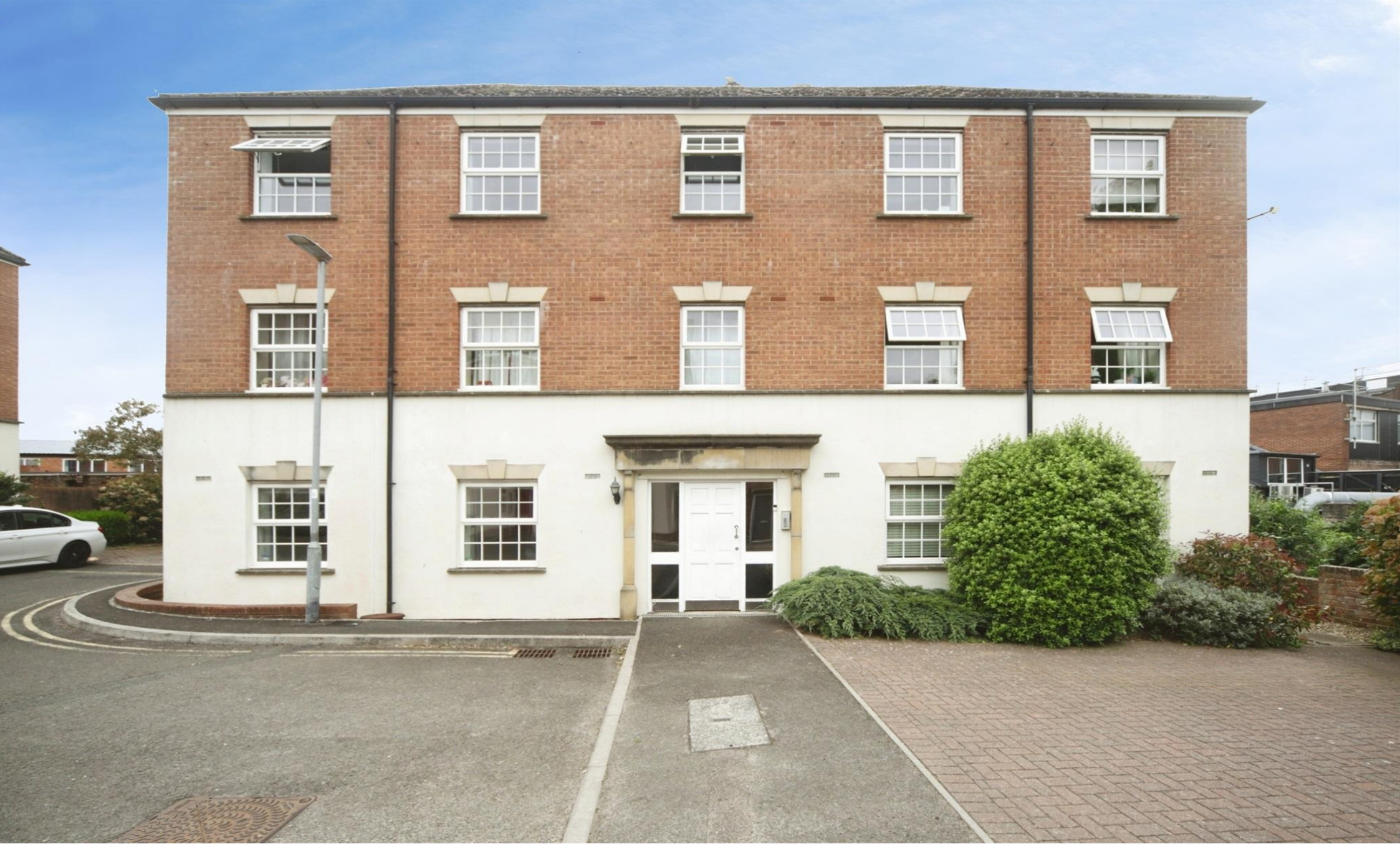
Gatehouse Court, Taunton TA1 1RX