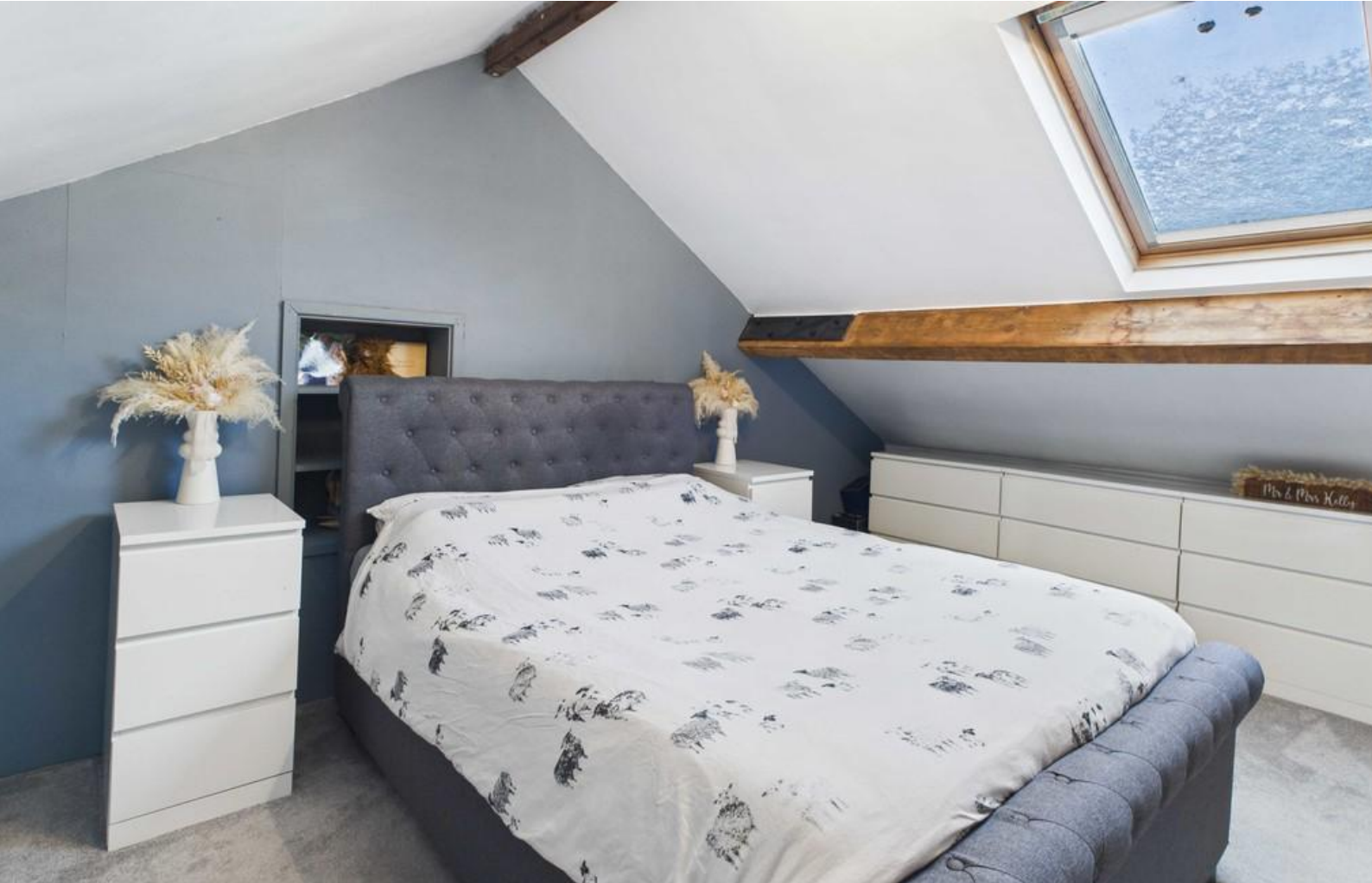
Master Bedroom (bedroom One)