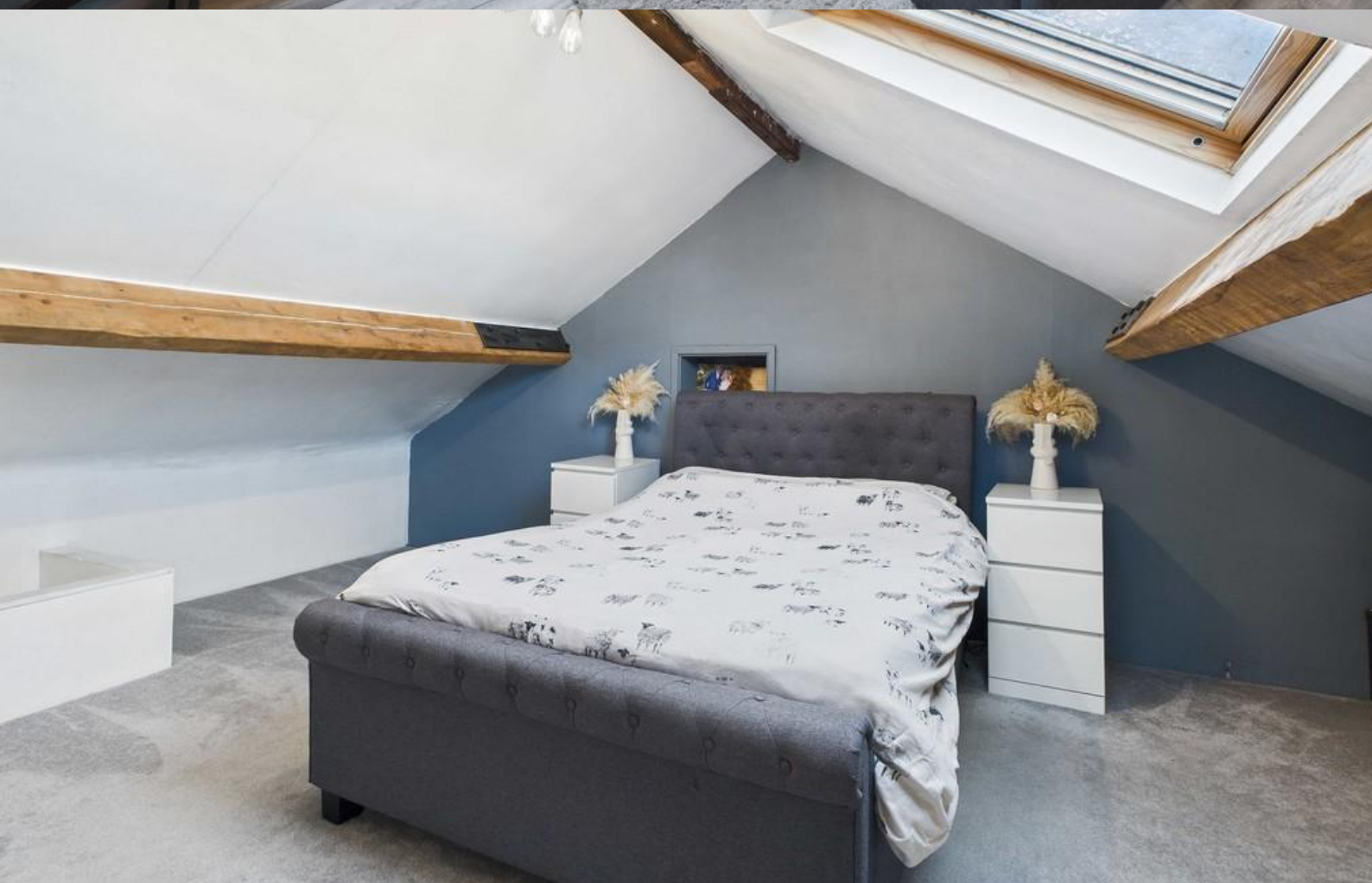
Master Bedroom ( Bedroom One)