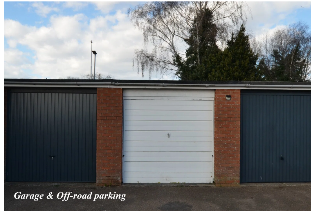
Garage & Off-road parking