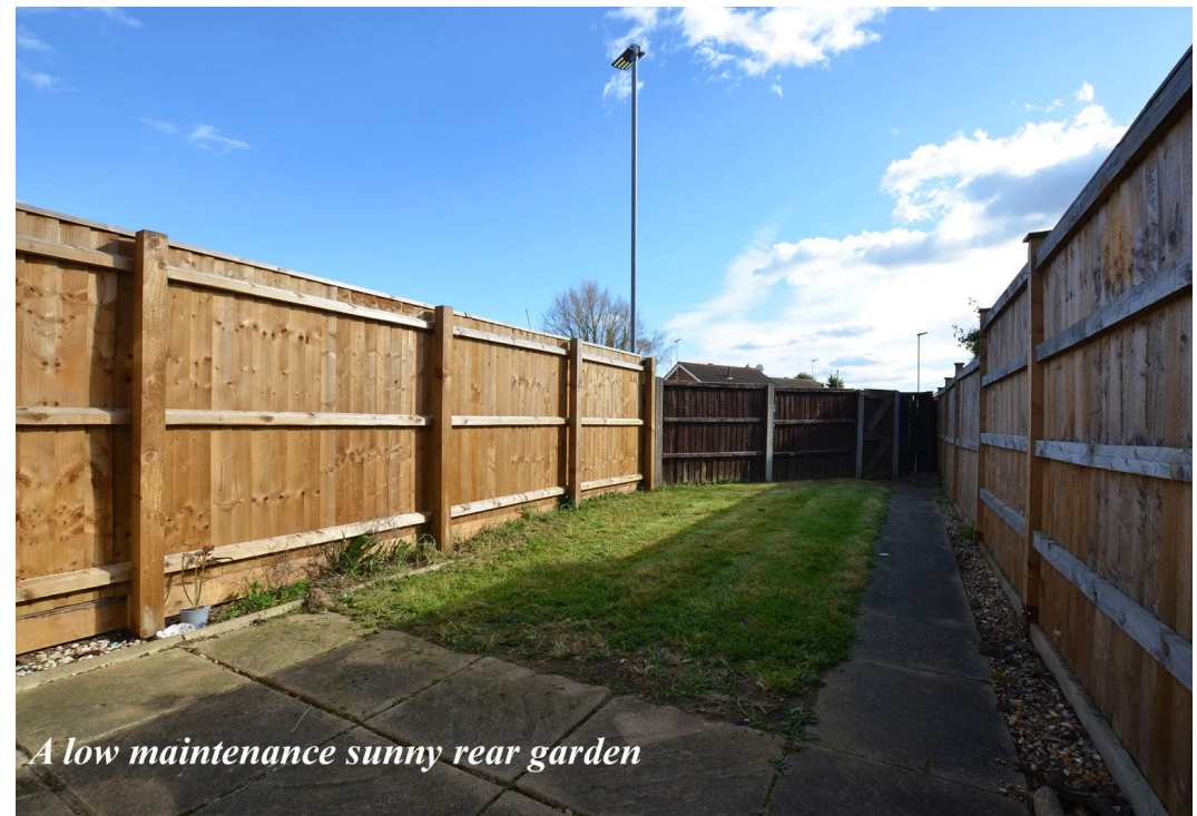
A low maintenance sunny rear garden