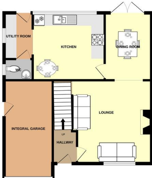
GROUND FLOOR 680 sq.ft. (63.1 sq.m.) approx.