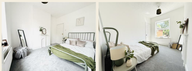
Bedroom 2 11'3" x 8'6" (3.43m x 2.59m)