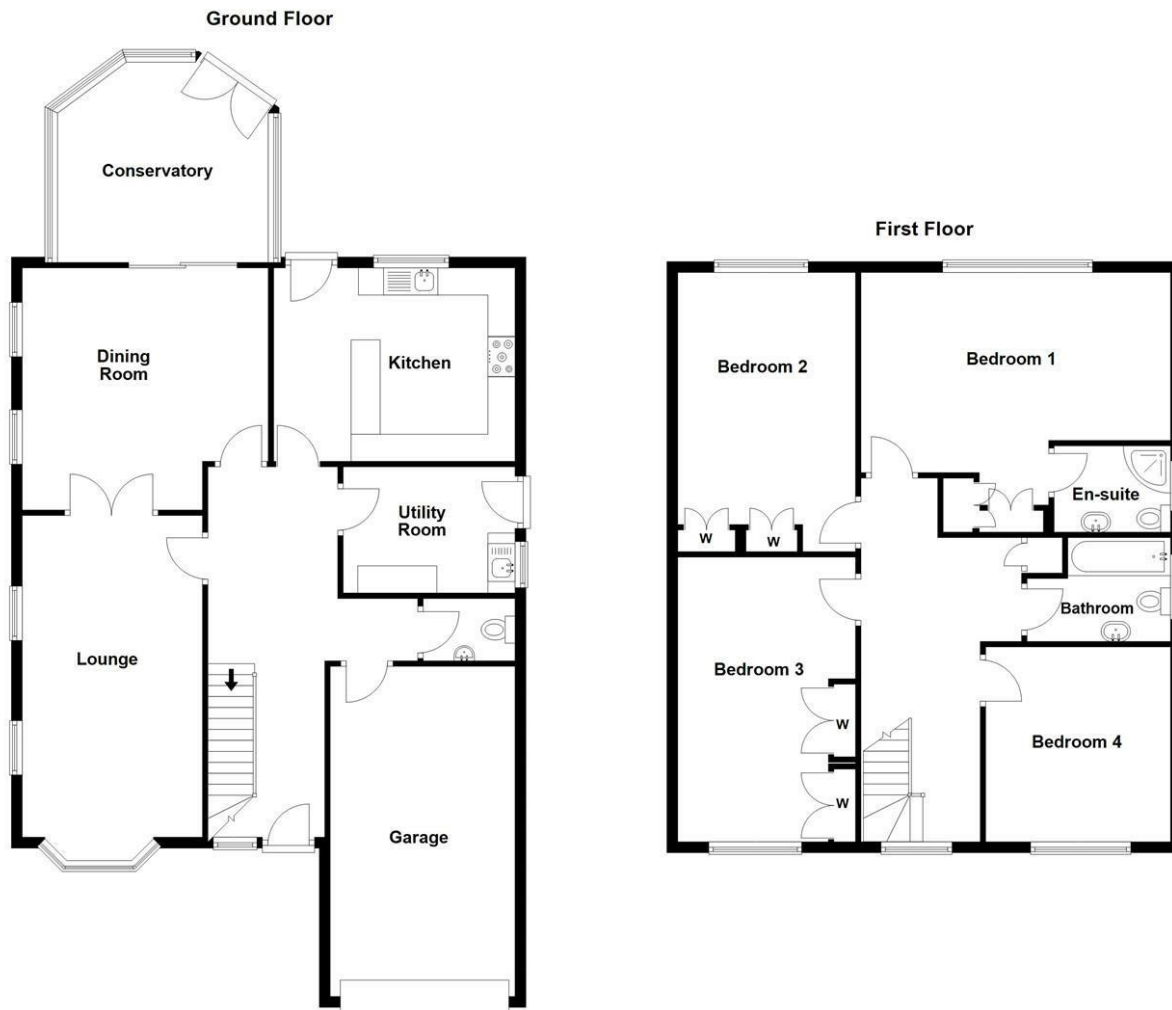
Floorplans are not to scale and for guidance only