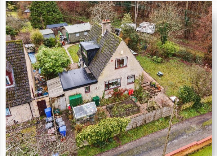
Marks Lane, Santon Downham, Brandon, IP27 0TW