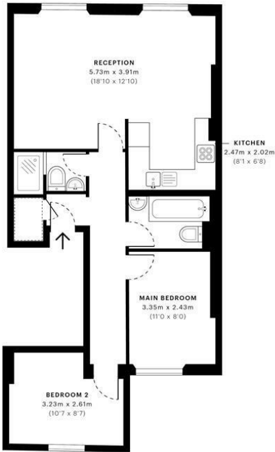
— Second Floor