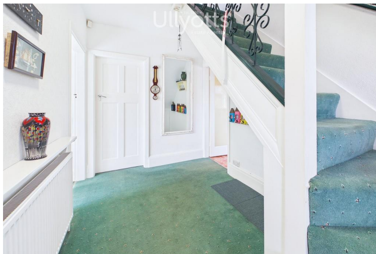
Hallway with stairs to first floor