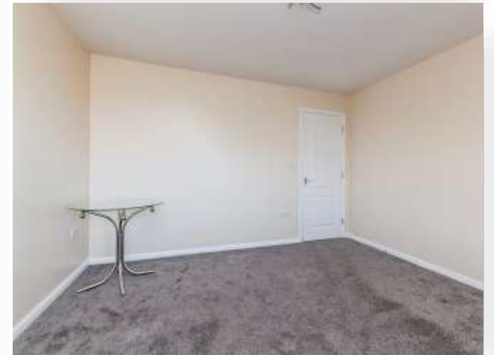
Queens Court Warren Road, Hartlepool TS24 9DP