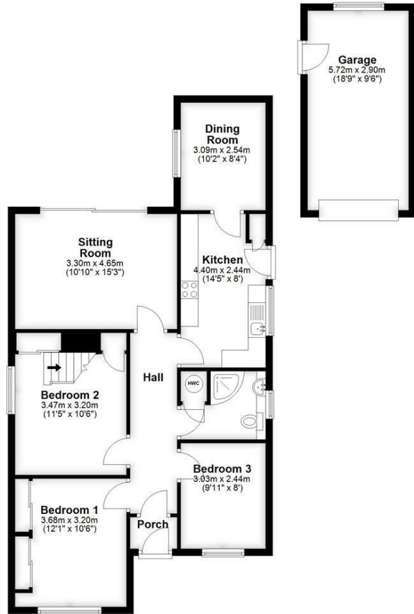
Total area: approx. 115.1 sq. metres (1238.7 sq. feet)