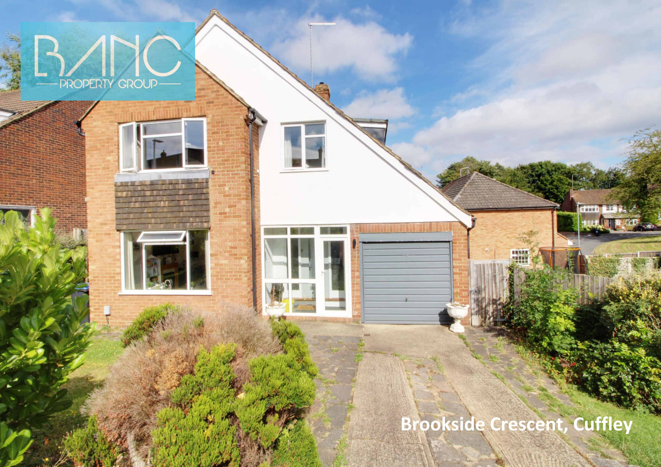
Brookside Crescent, Cuffley