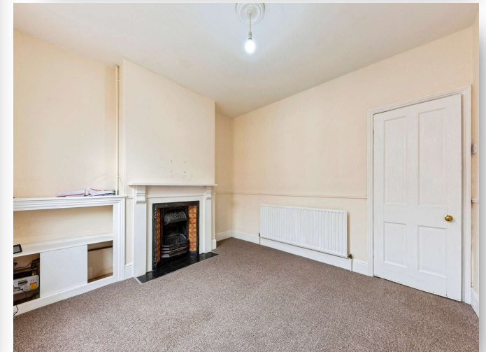
Nicholson Street, Newark NG24 1RD