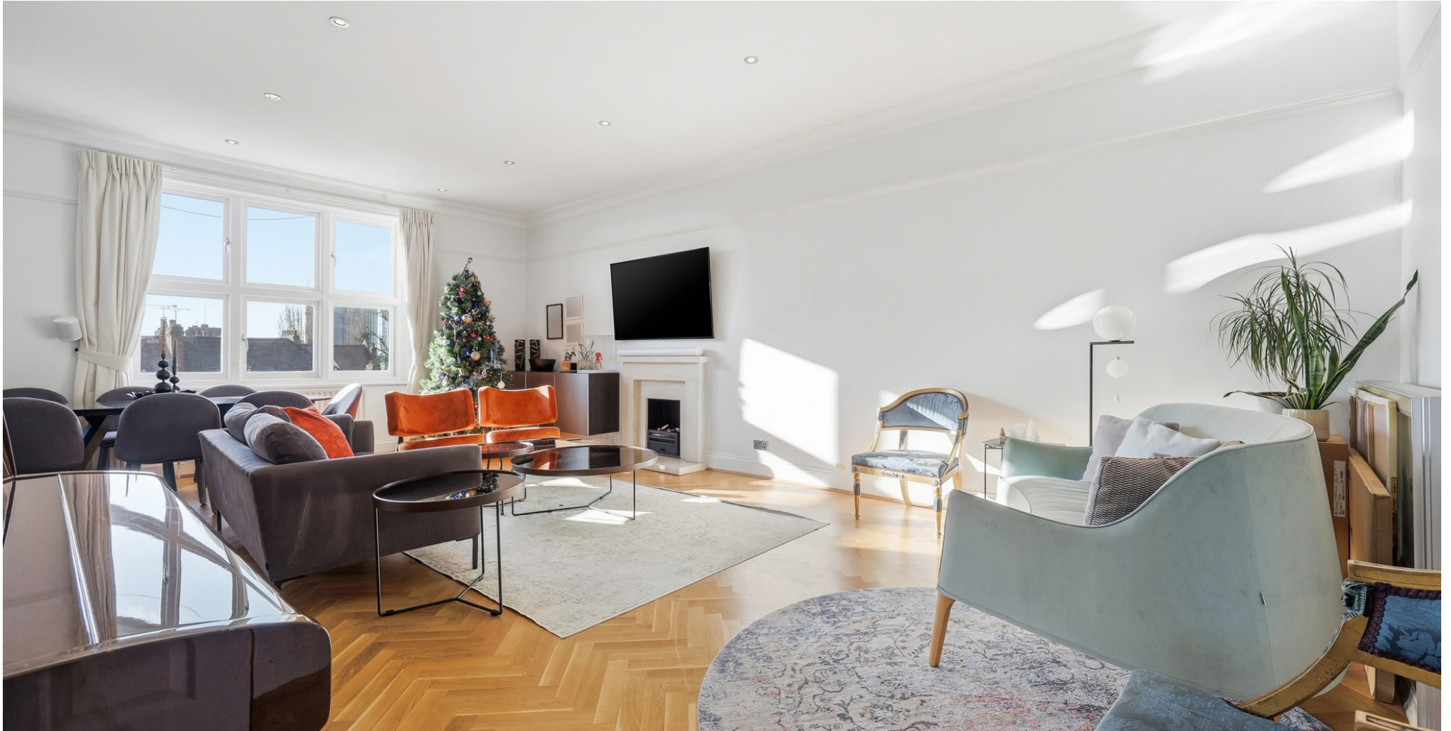
BELSIZE PARK GARDENS, NW3