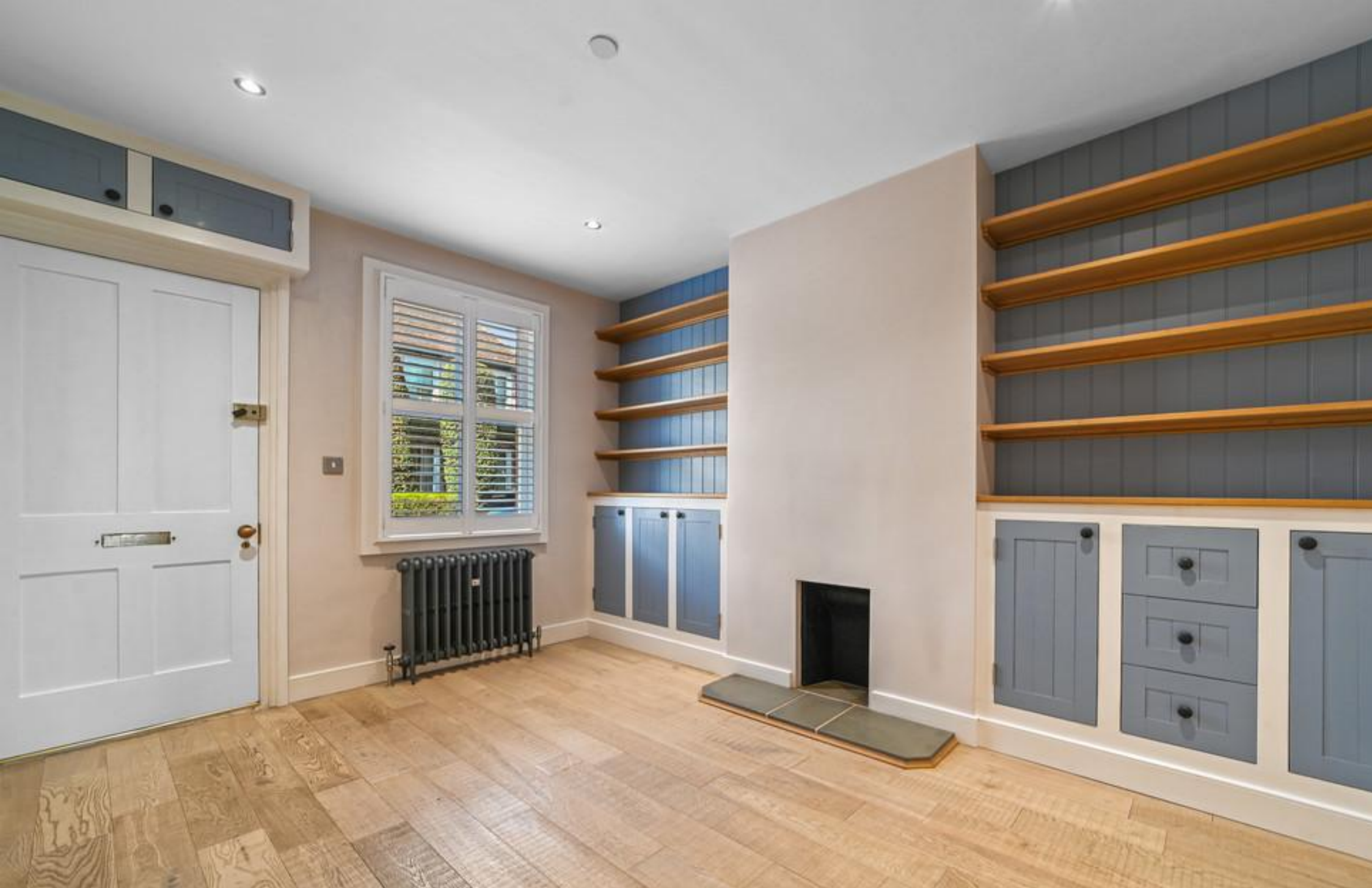
Ferndale Cottages Ford Street, Aldham, Colchester, CO6 3PH