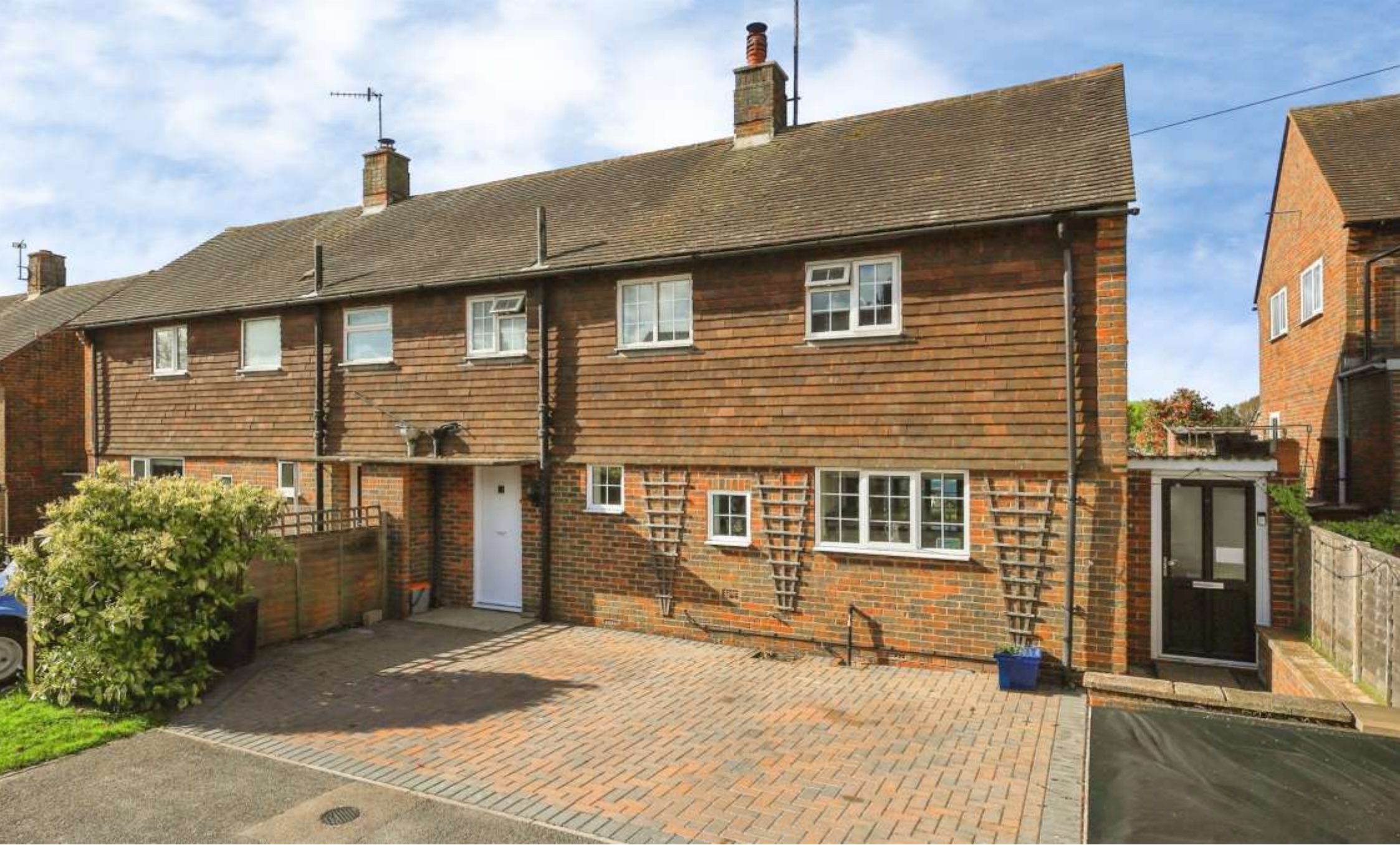
Buckwell Rise, Herstmonceux, Hailsham BN27 4LX