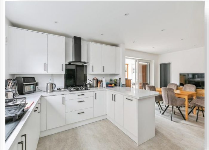
Church Street, Stilton Peterborough PE7 3RF