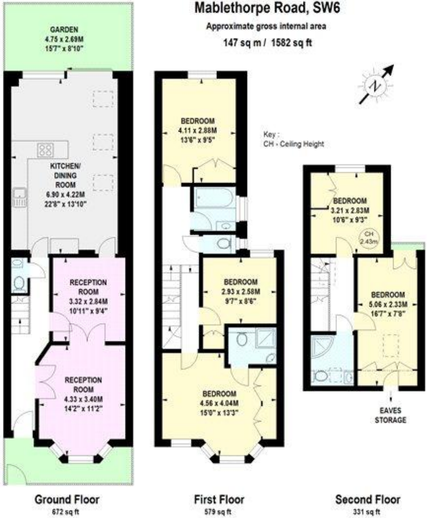
Illustration For Identification Purposes Only. Not To Scale *Floorplan Drawn According To RICS Guidelines Copyright of FeaturePRO

Approximate gross internal area 147 sq m / 1582 sq ft