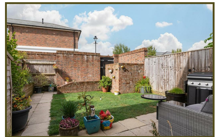
Coade Street, Dorchester