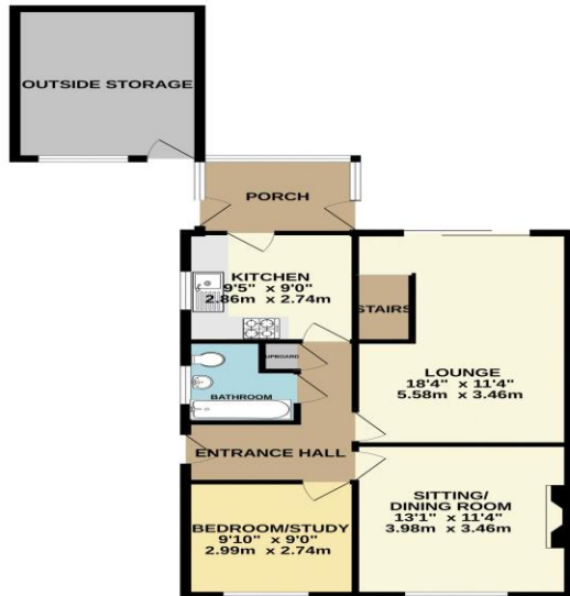
GROUND FLOOR 813 sq.ft. (75.5 sq.m.) approx.