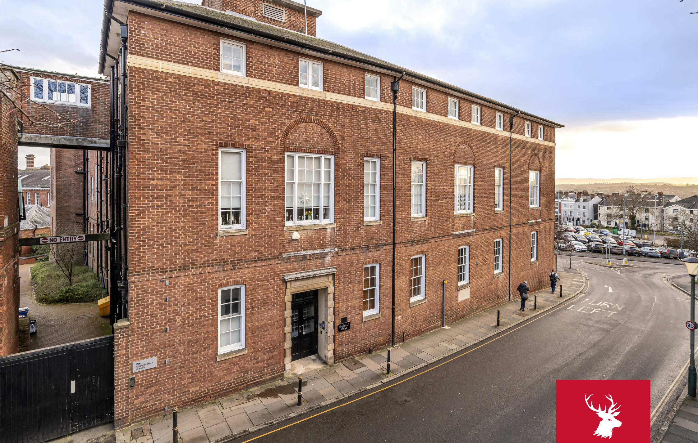
7 Cathedral Court