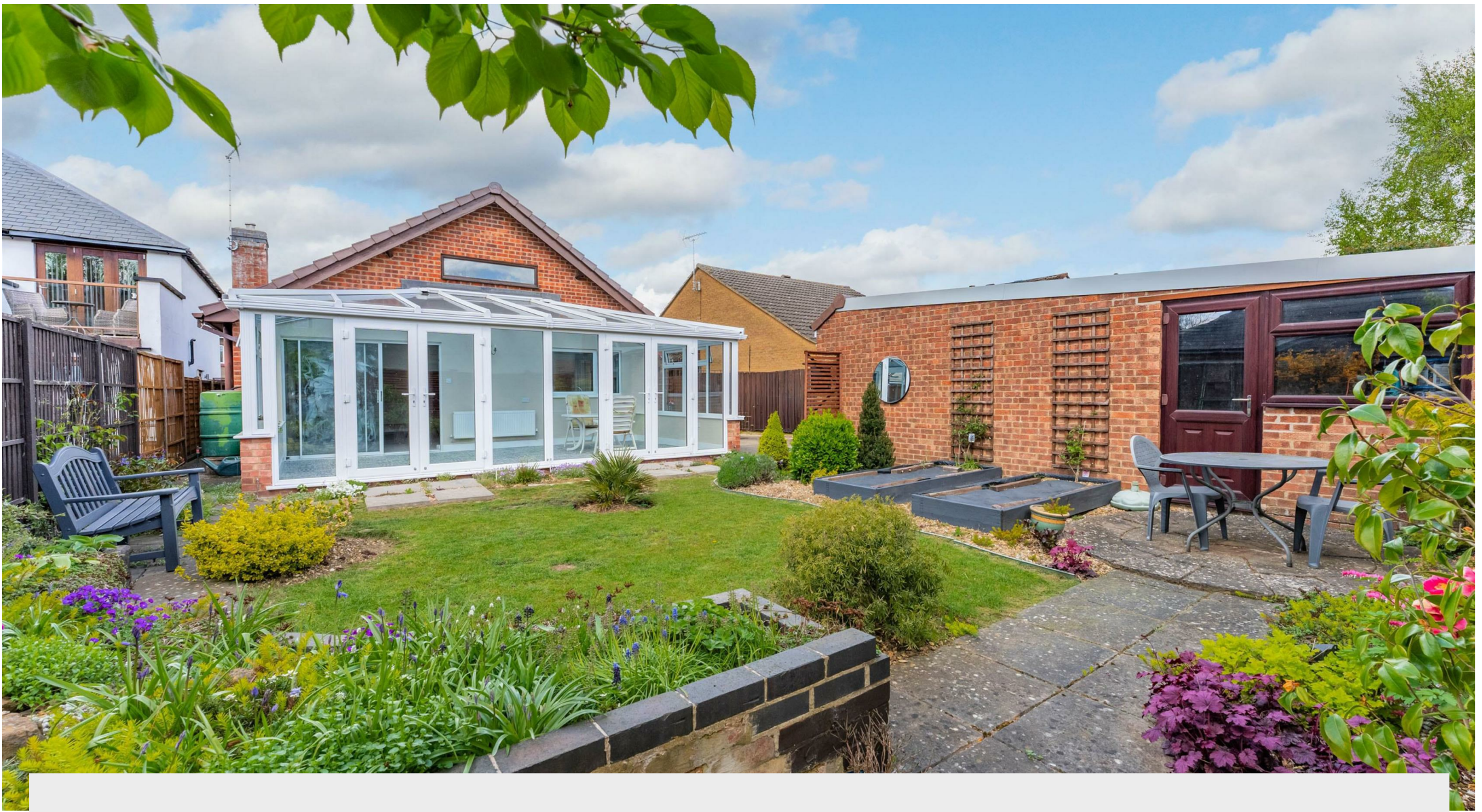
Landscaped Established Rear Garden.