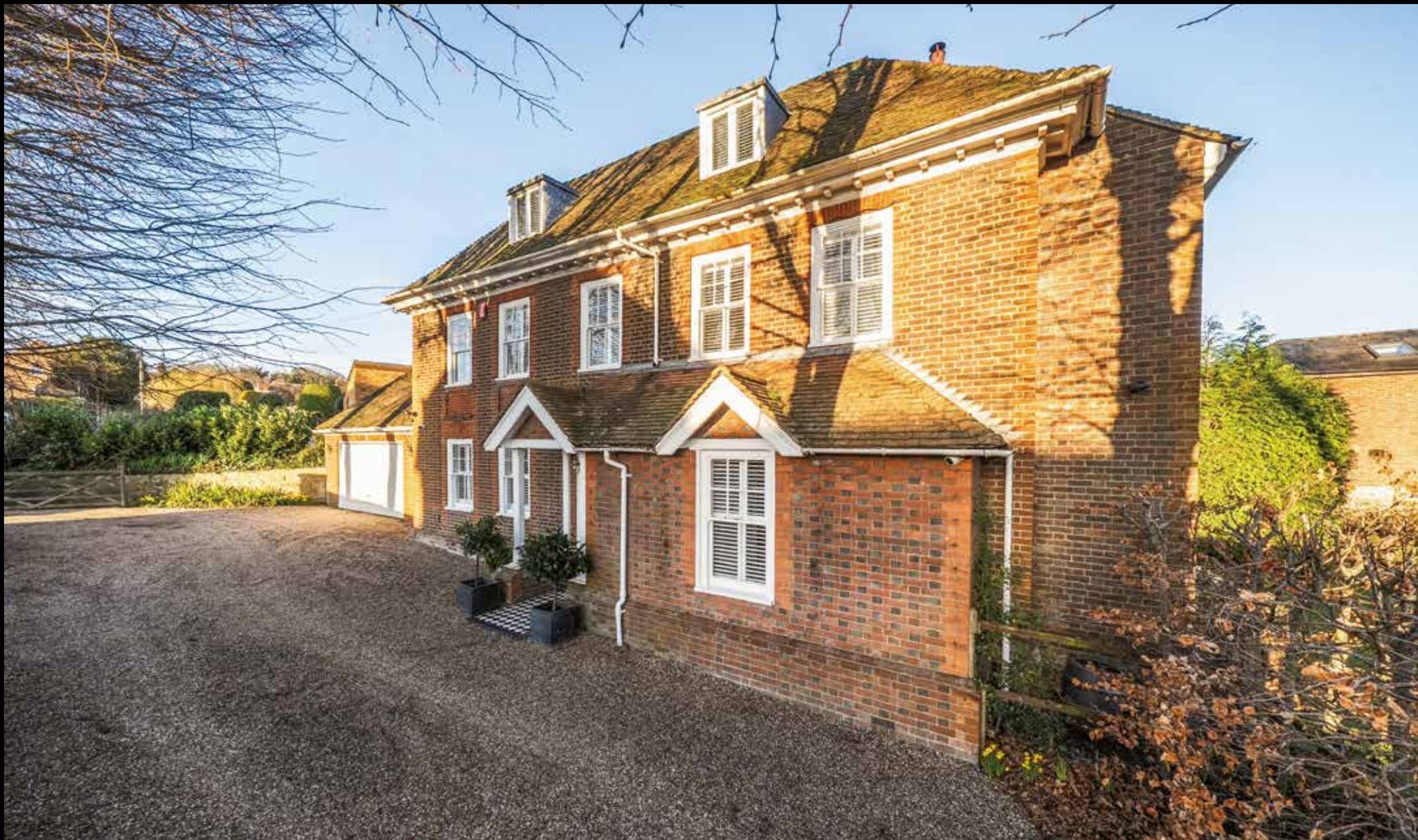
Becketts Croft Malling Road | Teston | Kent | ME18 5AR