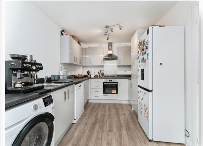
Havers Rise, Littleport CB6 1TF