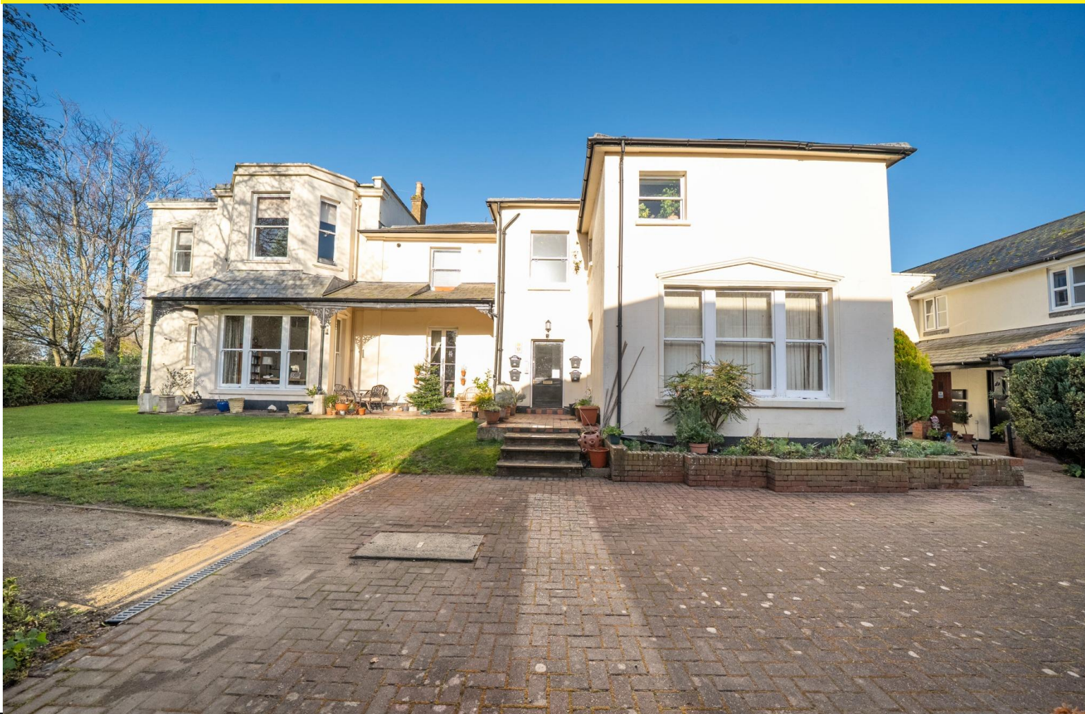
Weyhill Lodge, Andover