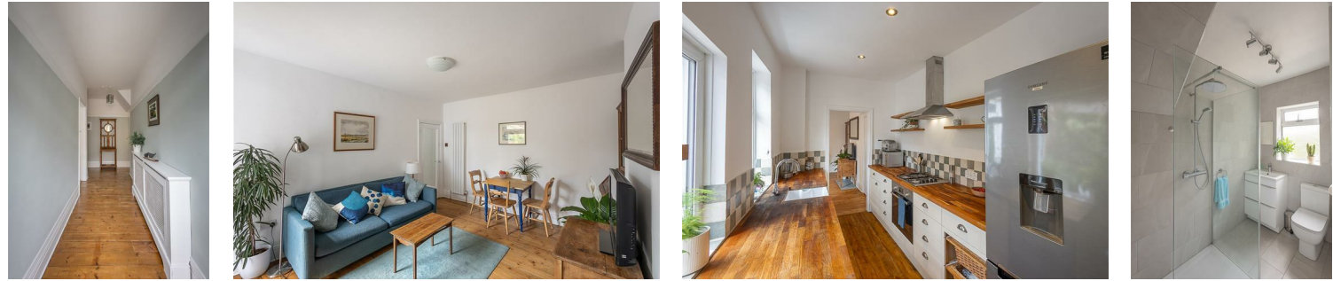
GROUND FLOOR 750 sq.ft. (69.7 sq.m.) approx.

1930's 'Tyneside' Flat | Well Presented | Two Bedrooms | 888 Sq ft (82.5m 2 ) | Sitting Room | Kitchen | Shower Room | South-West Facing Garden | Garage | Great Location | Close to Jesmond Dene | Leasehold - Tyneside Lease with Peppercorn Rent | Council Tax and A | EPC: C