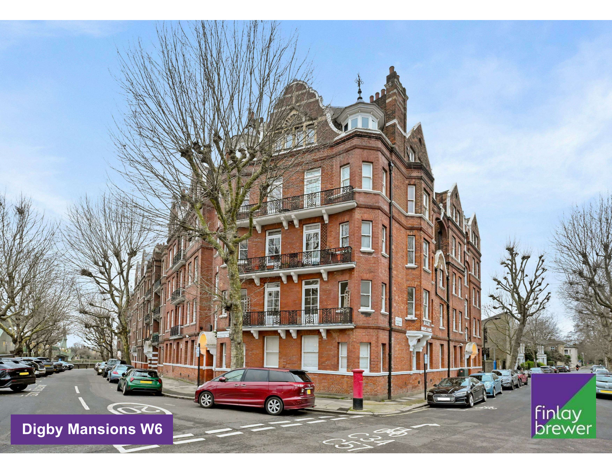
Digby Mansions W6