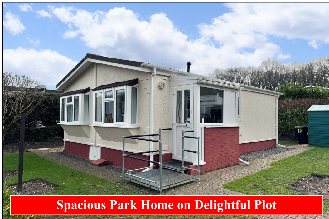
Spacious Park Home on Delightful Plot

73 Gladelands Park, Ringwood Road, Ferndown, Dorset, BH22 9BW