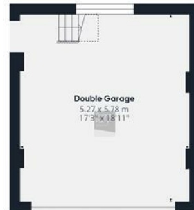
Ground floor Building 2