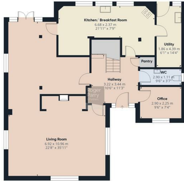
Ground floor Building 1