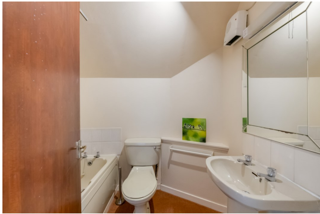
These particulars are believed to be correct, but their accuracy is not guaranteed and they do not form part of any contract. All measurements are approximate only.