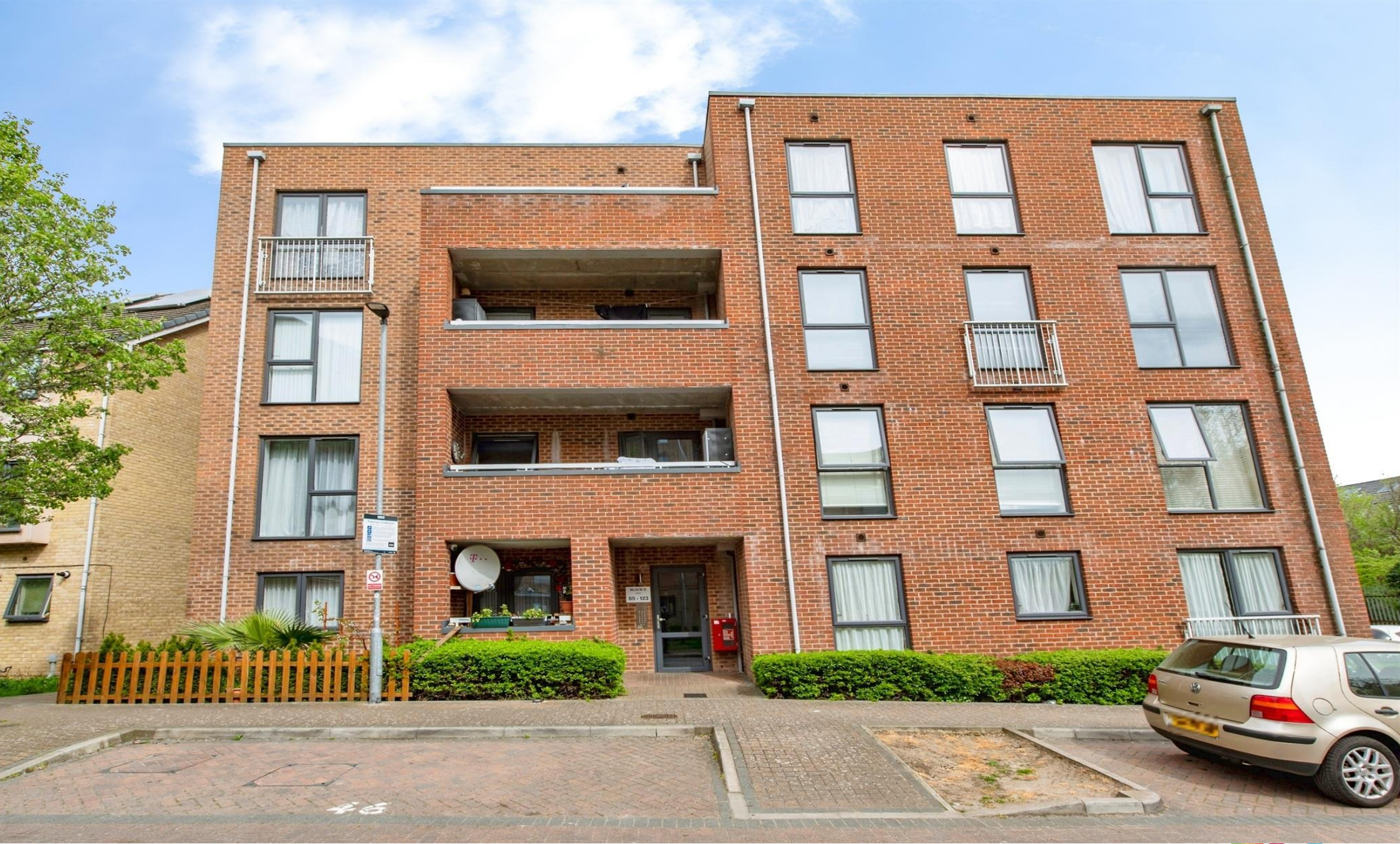
Draper Close, Grays RM20 4BL