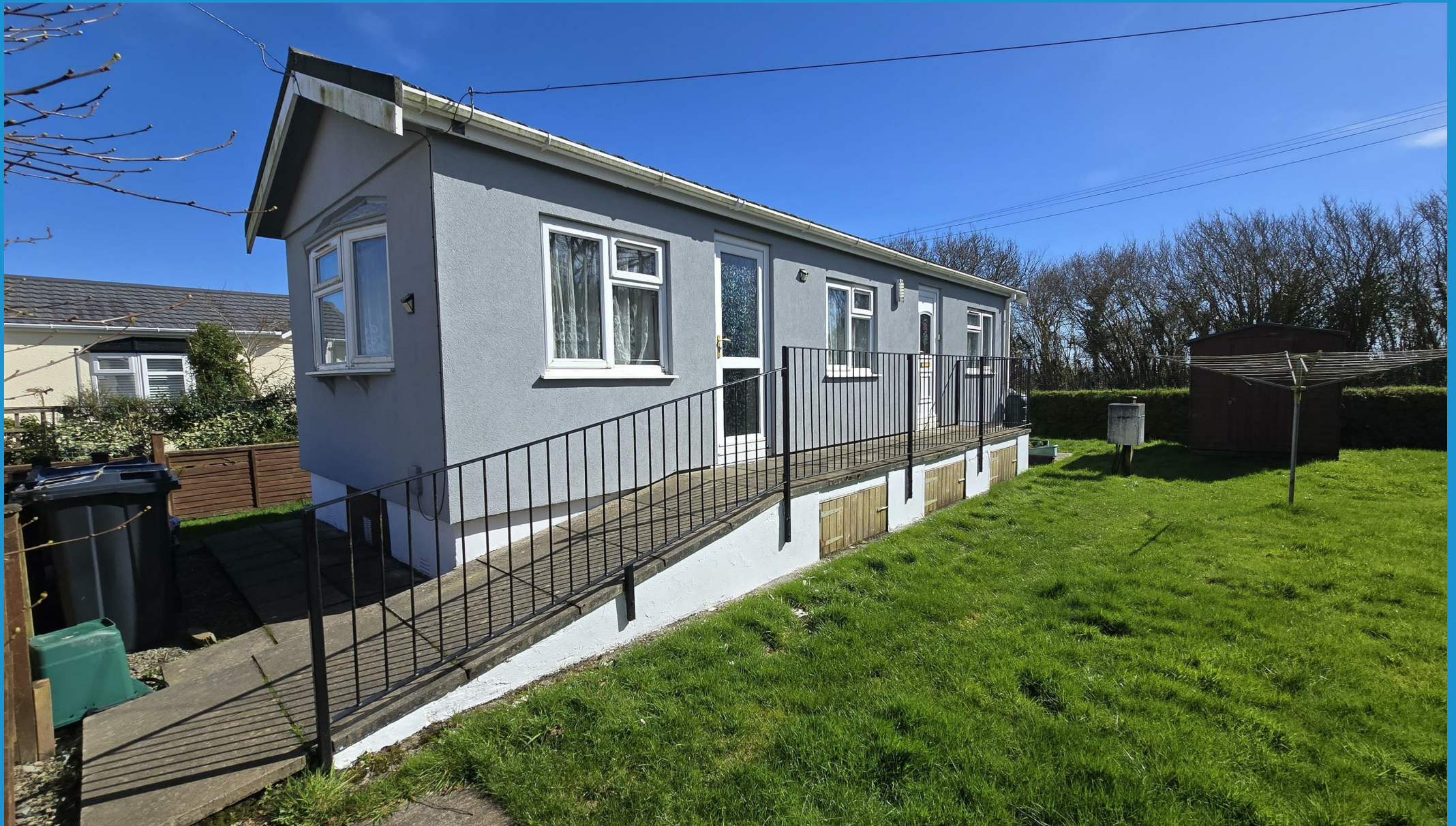
8 Trekeastle Park Tregadillett | Launceston