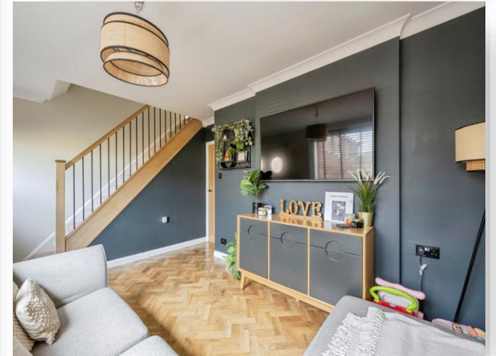
Melton Mill Lane, High Melton Doncaster DN5 7TF