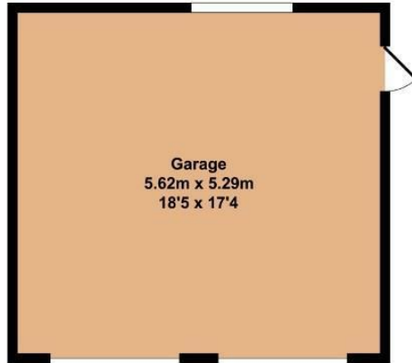
Garage Approx. Floor Area 29.72 Sq.M. (320 Sq.Ft.)

Whilst every attempt has been made to ensure the accuracy of the floor plan contained here, measurements of doors, windows, rooms and any other items are approximate and no responsibility is taken for any error, omission, or mis-statement. This plan is for illustrative purposes only and should be used as such by any prospective purchaser. The services systems and appliance shown have not been tested and no guarantee as to their operability or efficiency can be given.