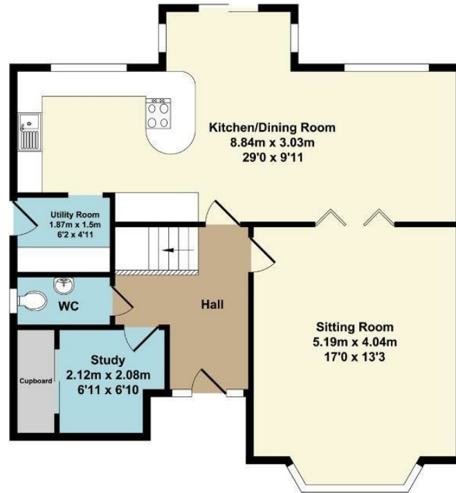
Ground Floor Approx. Floor Area 68.63 Sq.M. (739 Sq.Ft.)