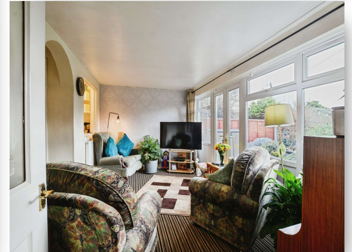
East Hills The Dell, Anderby Creek Skegness PE24 5XU