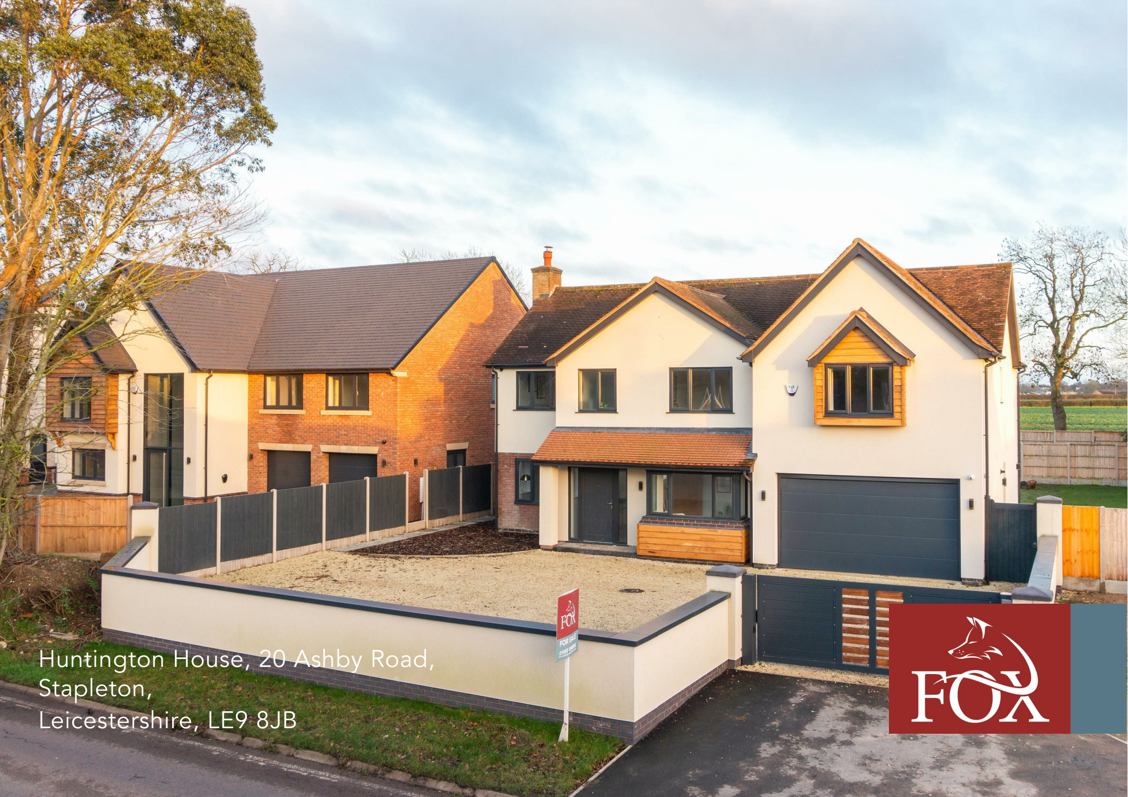
Huntington House, 20 Ashby Road, Stapleton, Leicestershire, LE9 8JB